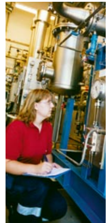
Monitoring the gas upgrading process