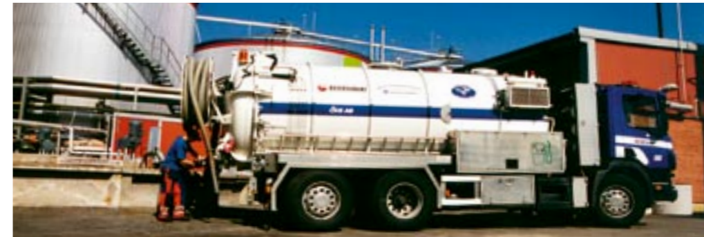
Unloading slaughter-house waste from Sweden's first biogas-driven industrial vacuum truck

All processes in connection with the production of biogas and the treatment of waste are very energy-efficient, and only a small portion of the energy content of the biogas is used in the production and distribution processes.